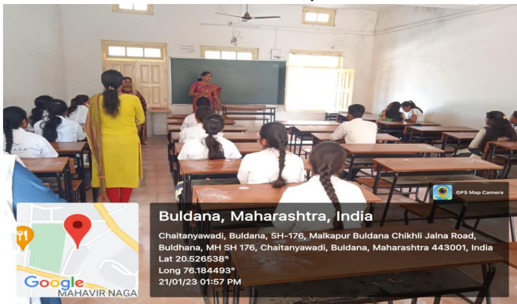
Head P. G. Department of Chemistry Jijamata Mahavidyalaya, Buldana.

Outputs: Guest lecture provide students with alternative perspectives, opinions, and personal experiences that can reinforce the teachings of the instructor. The guest lecture may have stories or anecdotes other than those used by the instructor.