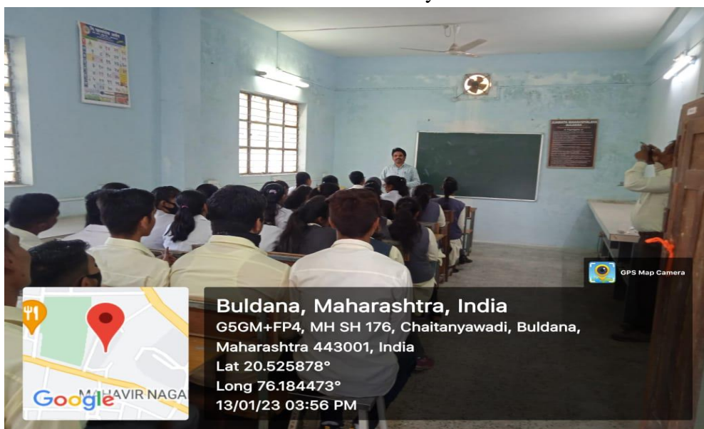
Head P. G. Department of Chemistry Jijamata Mahavidyalaya, Buldana.

Outputs: Guest lecture provide students with alternative perspectives, opinions, and personal experiences that can reinforce the teachings of the instructor. The guest lecture may have stories or anecdotes other than those used by the instructor.