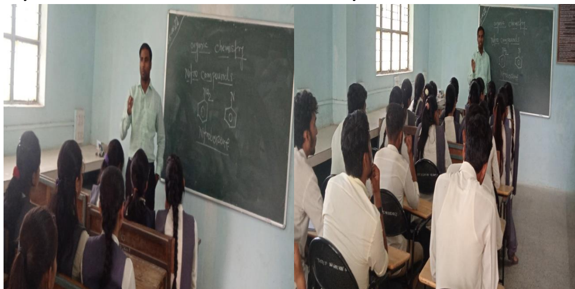
Head P. G. Department of Chemistry Jijamata Mahavidyalaya, Buldhana.

Outputs: Guest lecture provide students with alternative perspectives, opinions, and personal experiences that can reinforce the teachings of the instructor. The guest lecture may have stories or anecdotes other than those used by the instructor.