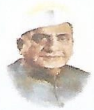
Dr. Panjabrao Deshmukh Founder President

CHIKHLI ROAD, BULDHANA -443001 NAAC Reaccredited 'B' (CGPA 2.88 ) 2013-18 Website: www.jmvbuldhana.ac.in E-mail : principaljmvbuldana@gmail.com