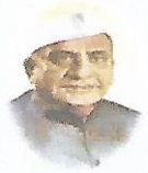
Dr. Panjabrao Deshmukh Founder President

CHIKHLI ROAD, BULDHANA -443001 NAAC Reaccredited 'B' (CGPA 2.88 ) 2013-18 Website: www.jmvbuldhana.ac.in E-mail : principaljmvbuldhana@gmail.com