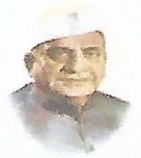
Dr. Panjabrao Deshmukh Founder President

CHIKHLI ROAD, BULDHANA -443001 NAAC Reaccredited 'B' (CGPA 2.88 ) 2013-18 Website: www.jmvbuldhana.ac.in E-mail : principaljmvbuldhana@gmail.com