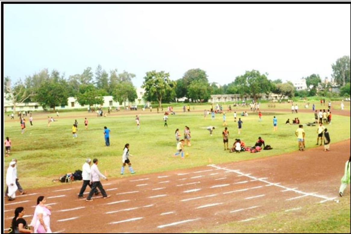
400 Meter Running track